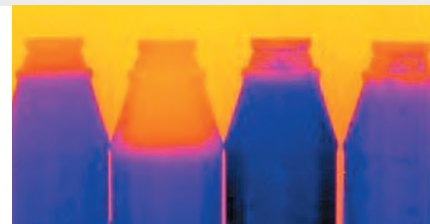
Detecting liquid levels in visually opaque bottles.