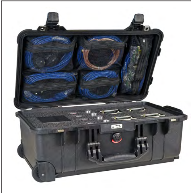
Figure 1. SCS 770051 ESD Event Diagnostic Kit