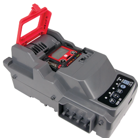
Calibration Station SDM-3R