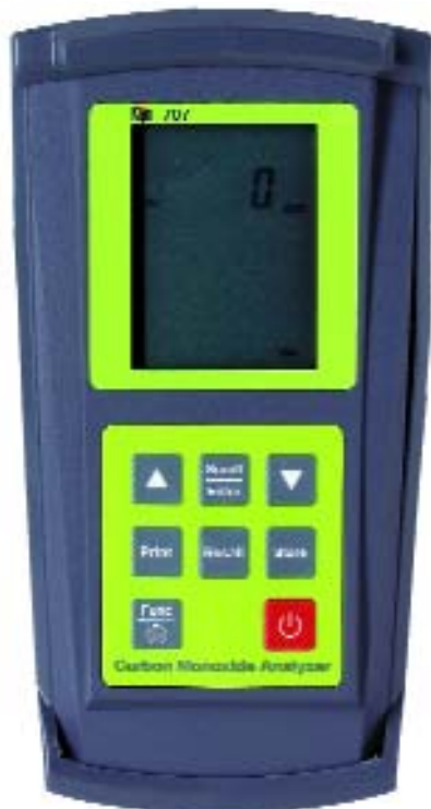
4.0" w X 8.12" h x 2.25" d

Test flue gasses at home or office spaces for the presence and location of CO leaks. With a protective rubber boot, the new 707 fits comfortably in your hand and operates with the push of a button.