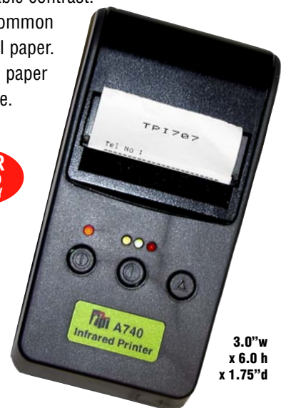
3.0" w x 6.0 h x 1.75" d