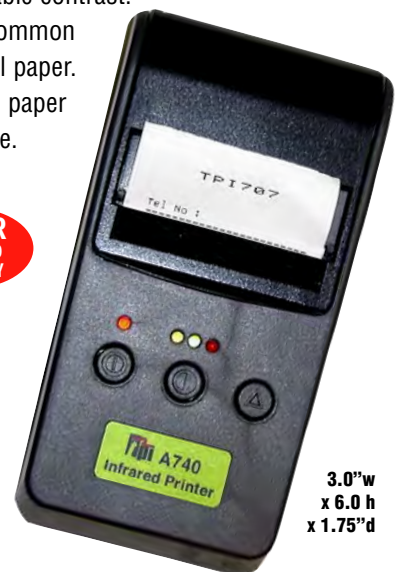
3.0" w x 6.0 h x 1.75" d