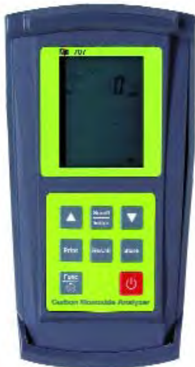
4.0" w X 8.12" h x 2.25" d

Test flue gasses at home or office spaces for the presence and location of CO leaks. With a protective rubber boot, the new 707 fits comfortably in your hand and operates with the push of a button.