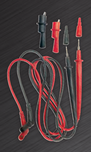
Test Lead Set, Right Angle 69410 Standard banana-type inputs compatible with most multimeters and clamp meters