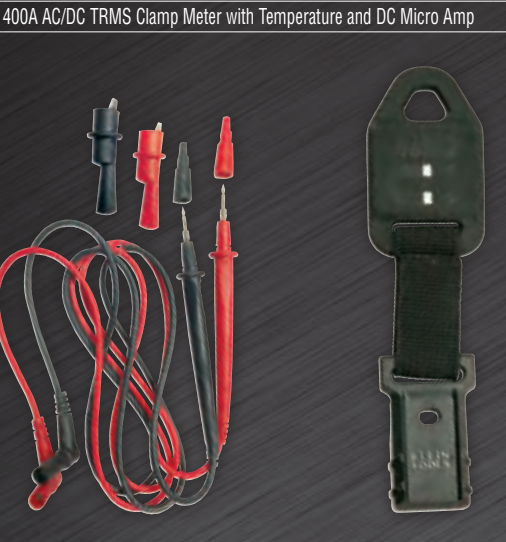
Magnetic Hanger with Strap 69417 Powerful rare-earth magnet; durable nylon weave strap; fits all newer clamp meters