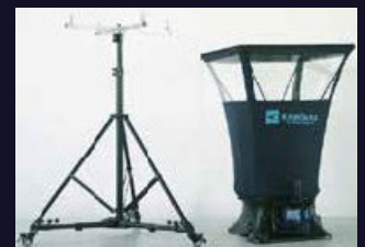
Portable stand: extends up to 6.9' from top to base