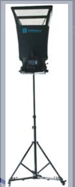
New portable stand: extends up to 6.9' from top to base