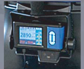
Full color backlit LCD tilts to be viewable from any on-leg