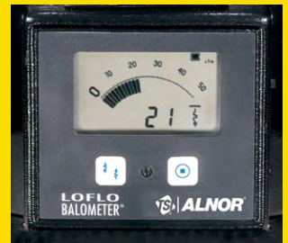
Model 6200D with display detail