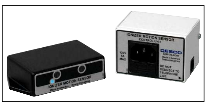
Figure 1. Desco 60509 Ionizer Motion Sensor