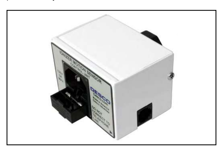
Figure 6. Replacing the fuse in the Control Unit

The fuse located in the Control Unit may be replaced by removing the power cord and opening the fuse drawer at the IEC inlet. The Control Unit uses one 5A, 250V slow blow fuse. DO NOT use other ratings as it may pose a safety hazard.