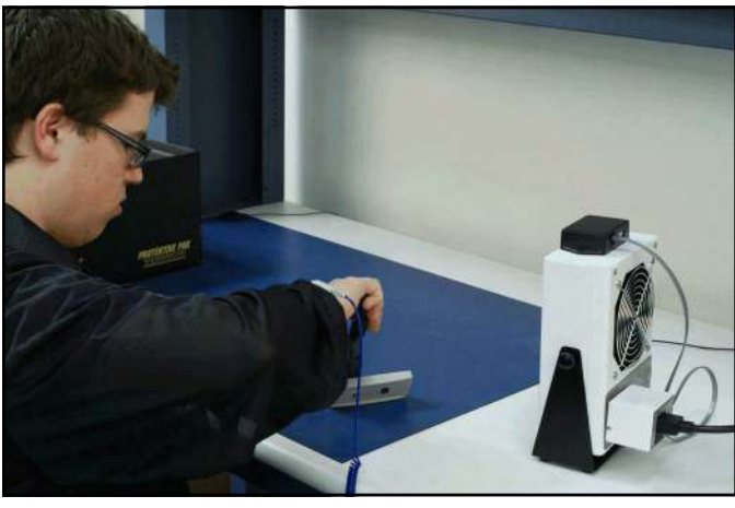
Figure 4. Using the Ionizer Motion Sensor with the 60505 High Output Benchtop Ionizer

Leave the sensor's field of view to activate the shutoff delay timer. The Ionizer Motion Sensor's LED will turn off and unpower the ionizer once the preset deactivation delay time is reached.