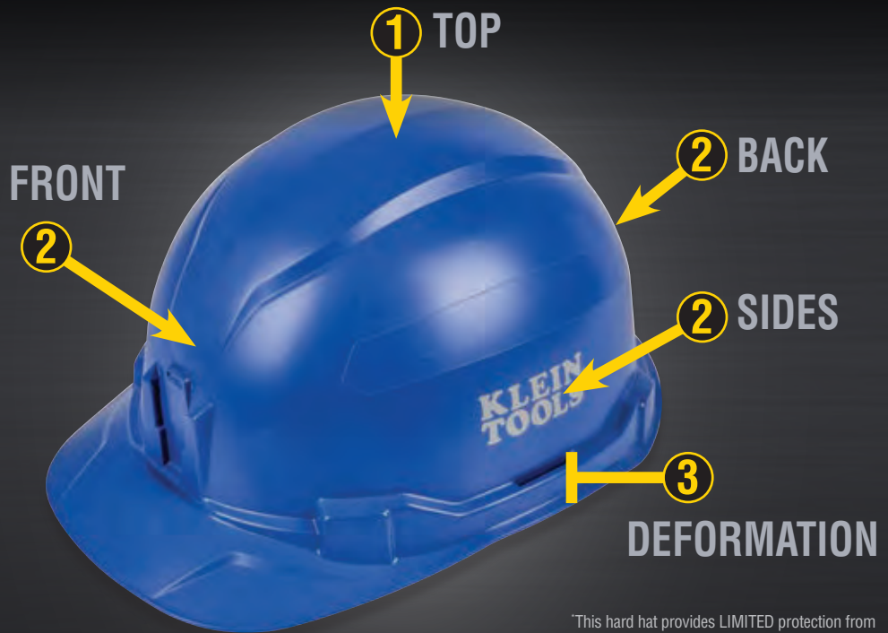
(Shown: SKU 60248; TYPE I, CLASS E)

This hard hat provides LIMITED protection from small objects striking the top, front, back, left and right sides of the hard hat. This is NOT an ANSI/CSA Type II hard hat.