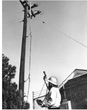
The detector is excellent for patrolling pole lines.