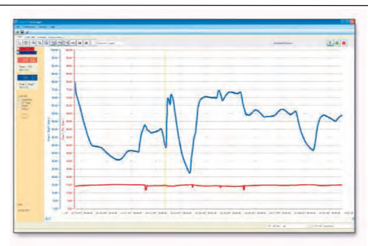
Track-It™ Transport App

View a numerical data table or graphical representation of data readings relative to time. Use the graph tools such as zoom, cursor, min and max to examine and analyze the record. Track-It™ Software turns your PC into a real time data acquisition system by allowing you to stream graphical or tabular data directly to your PC. Export stored data into a spreadsheet in its entirety or partially using filters.