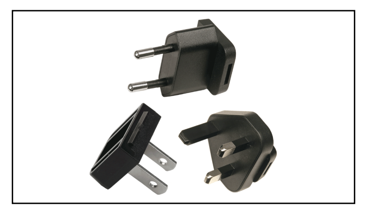
Figure 2. Interchangeable power adapter plugs included with the Mini Zero Volt Ionizer 2