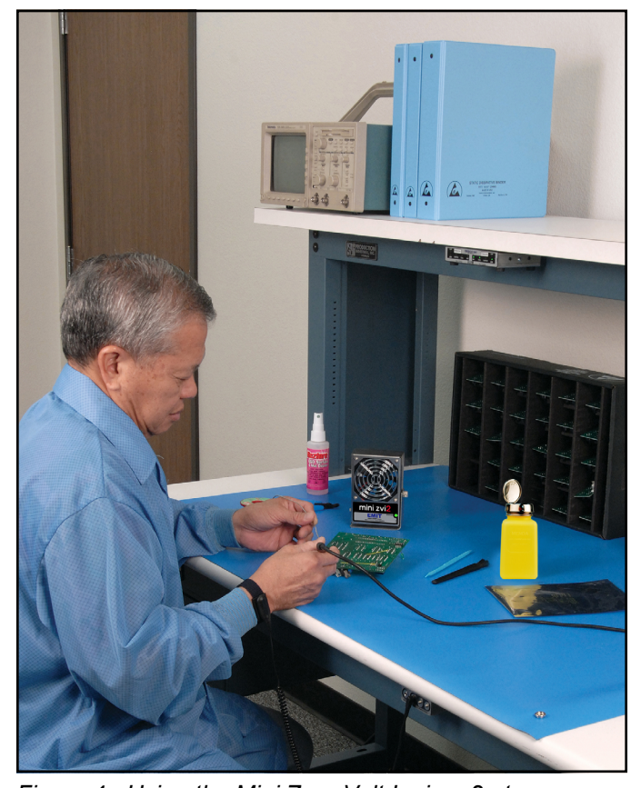
Figure 4. Using the Mini Zero Volt Ionizer 2 at a workstation.

Connect the power adapter to the ionizer to turn it on. When the unit is first turned on, it conducts a self-test. The audible alarm will sound, and the status LED will cycle through orange and green. The LED will remain green during normal operation.