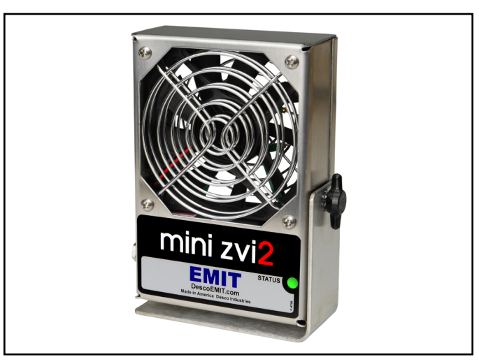
Figure 1. EMIT 50642 Mini Zero Volt Ionizer 2