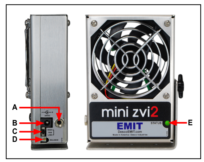
Figure 3. Mini Zero Volt Ionizer 2 features and components