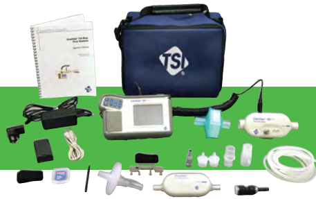
4080 High-flow test system with 4082 Low-flow kit (sold separately)