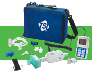
4070 High-flow test system with 4073 Oxygen sensor kit (sold separately)

TSI and the TSI Logo are registered trademarks of TSI Incorporated.