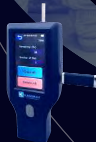
Sleek/Modern Instrument Design