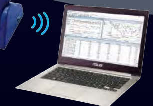
Windows 10 Compatible Software