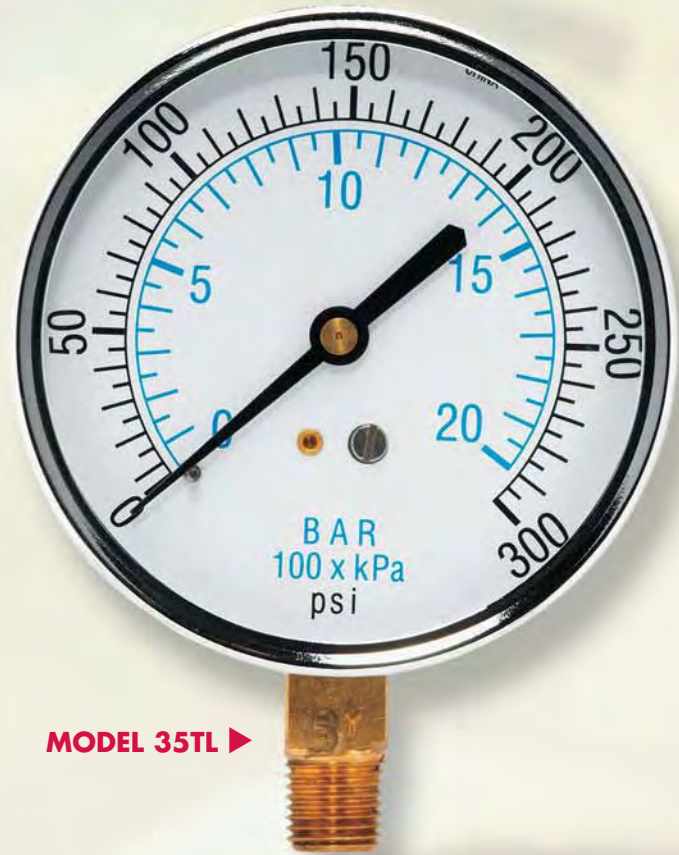
MODEL 35TL ▶