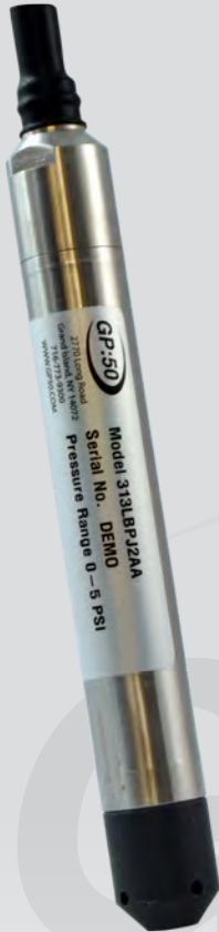
Model 313L Submersible Level Transmitter