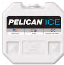
PI-1LB 1lb Ice Pack