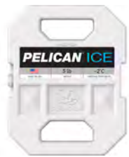
PI-5LB 5lb Ice Pack