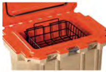
30-WB Dry Rack Basket