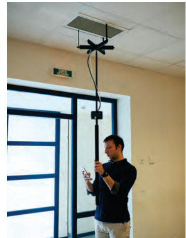
Use with the measurement grid