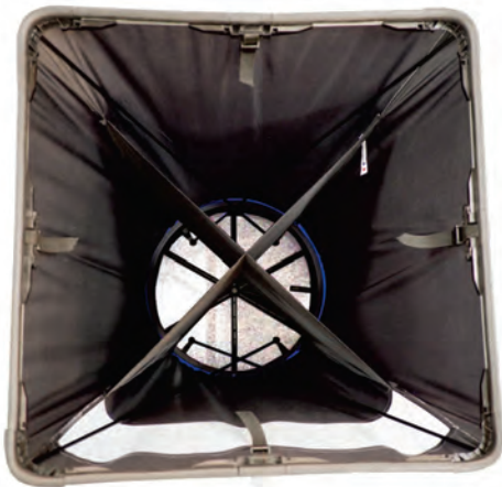
Hood with flow straightener