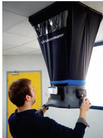
Use of the air flow meter