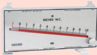
Mark II Model No. 40-1 inclined manometer