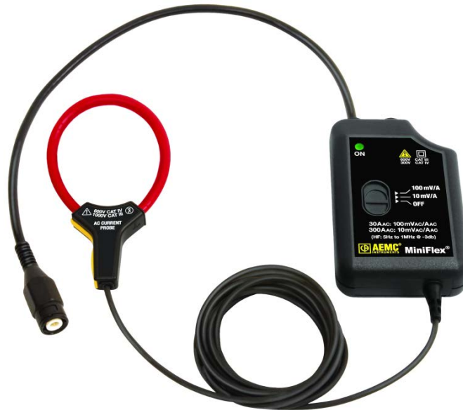
MF 300-10-2-10 HF Probe (a member of the MiniFlex family)

AmpFlex and MiniFlex probes are lightweight and can be installed in tight spaces, around cable bundles, around wide or large bus bars, or even wrapped around irregular shapes. Probes create virtually no load to the system under test, have a low phase shift and excellent frequency response, and cannot be damaged by overloads. Probes are insensitive to DC currents; only the AC component of the measured signal is displayed.