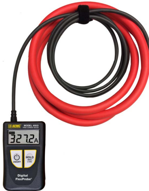
Digital FlexProbe (a member of the AmpFlex family)

The AEMC AmpFlex ® and MiniFlex ® families of AC current probes enable measurements on conductors where standard clamp-on probes cannot be used.