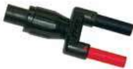
Banana (female) - BNC (male) Adaptor Catalog #2118.46 (optional)

**Available as special orders only. Contact customer service for current list price.