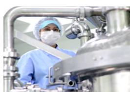
Laboratories & Clean