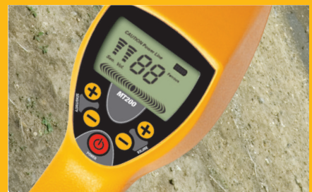
On/Off, Volume and Sensitivity Controls