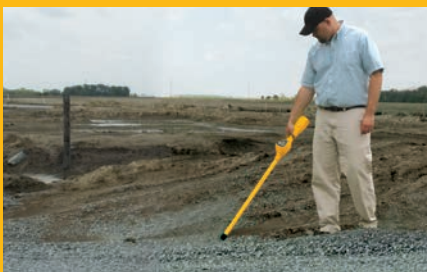
Waterproof Locator Tube and Water-Resistant Housing

Locates Ferrous Objects Under Ground, Under Water or in the Snow up to 15-ft Below the Surface