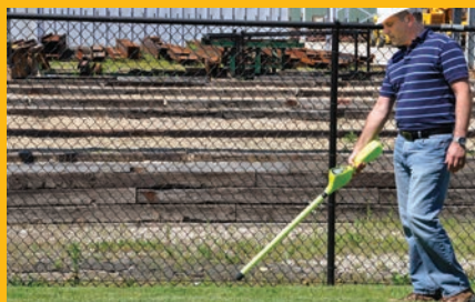
Erase Function blocks out magnetic interference (MT102 and MT202 only)