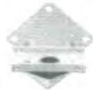
Wall or Post Bracket 366

MODEL 357: Wing Nut allows pivoting so that Measurer can be stored out of the way when not in use. Extends 7-1/2". Wt. . . . . 1 lb. (.46 kg)