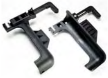
1438 Boat Bracket Kit