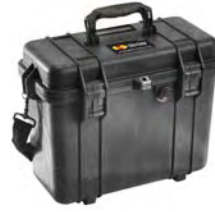
1430NF No Foam