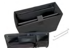
1436 Office Divider Kit