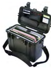
1437 With Padded Office Divider Set & Lid Organizer