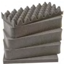
1431 5 pc. Replacement Foam Set