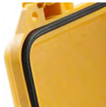
1433 Replacement O-ring