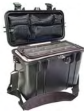
1434 With Padded Dividers & Lid Organizer