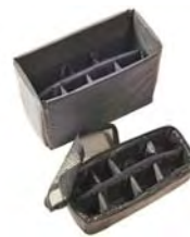
1435 Padded Divider Set