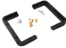
1430PF Special Application Panel Frame