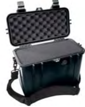
1430WF With Foam