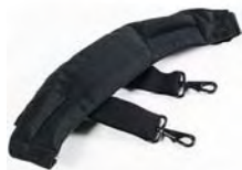
1432 Strap Kit