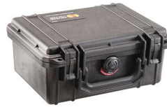
1150NF No Foam