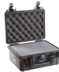
1150WF With Foam