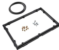
1150PF Special Application Panel Frame