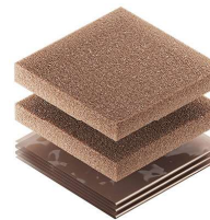
1500CI Corrosion Intercept