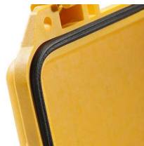
1153 Replacement O-ring