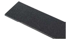
1150TPDIV Extra TrekPak Dividers