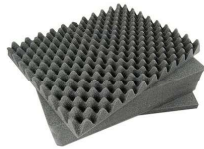
1151 3 pc. Replacement Foam Set