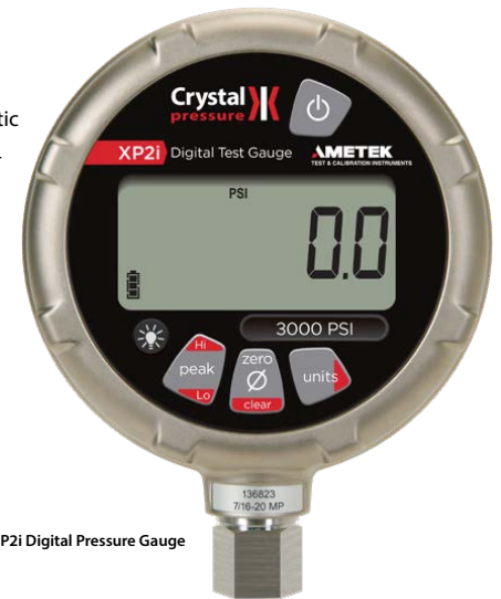
The XP2i Digital Pressure Gauge