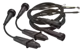
+ DH4-C probe 1.5 m leads