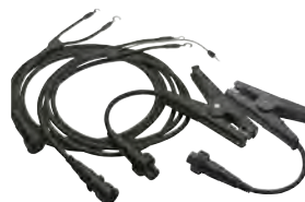
+ KC1 Kelvin clip 3 m leads