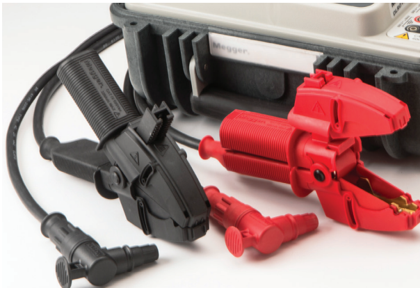
A new tough adjustable clamp has been designed to ensure flexibility in many applications and provides a good connection with the test piece