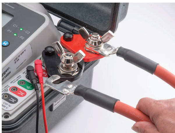
A new terminal adapter has been designed to enable the use of users own test leads.