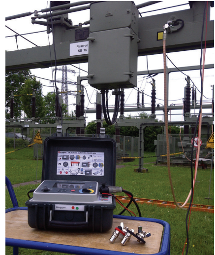
DLRO100 testing circuit breaker