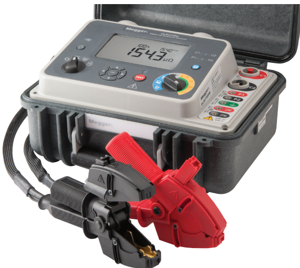
Optional CATIV 600 V Kelvin clips: two wire lead set (red/black) available in 5m, 10m or 15m lengths