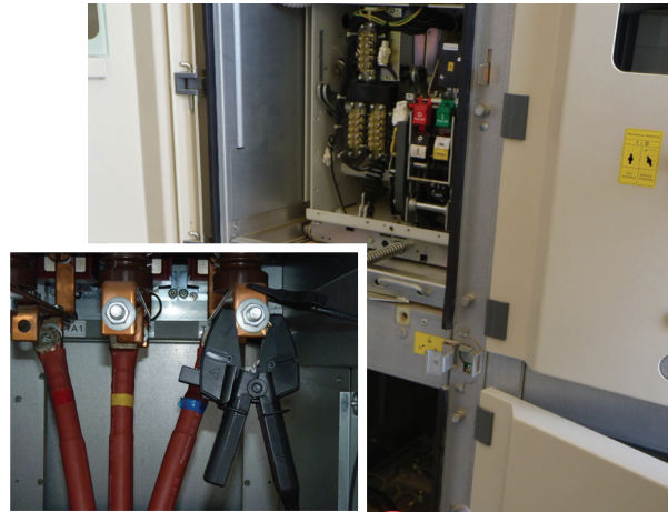
DLRO100H testing rack-mounted, 3-phase circuit breakers