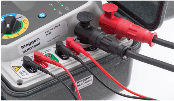
Robust, high-current CATIV leads for Kelvin configurations; current clamps for measurement on circuit breakers