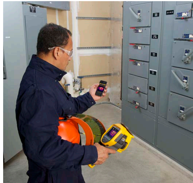
Create an inspection report while still at the inspection site and communicate directly to your client or manager via your Apple®, iPhone® or iPad®.

than ambient, it's difficult to detect problems with thermal imagery.) Incorporate the guidelines above for connections and imbalances. The cooling tubes should appear warm. If one or more tubes is comparatively cool, oil flow is probably restricted. Keep in mind that like an electric motor, a transformer has a minimum operating temperature that represents the maximum allowable rise in temperature above ambient (typically 40 °C). A 10 °C rise above the nameplate operating temperature will probably reduce the transformer's life by 50 percent.