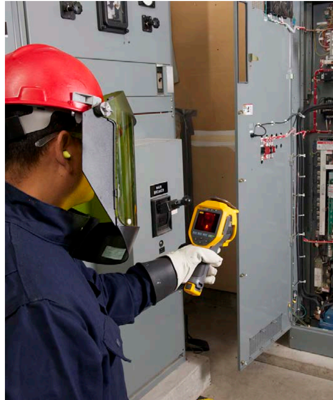
When scanning a live electrical panel, wear appropriate 70E personal protective equipment for arc flash and stand at least four feet away.

Objects that have high emissivity emit thermal energy well and are not usually very reflective. Materials that have low emissivity are usually fairly reflective and do not emit thermal energy well. This can cause confusion and incorrect analysis of the situation if you are not careful. A thermal imager can only accurately calculate the surface temperature of an object